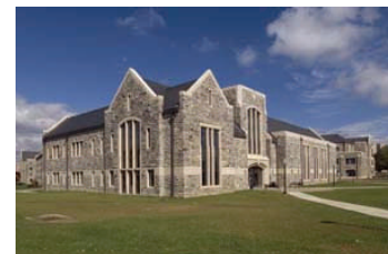
Smith Career Center

The Center is an excellent resource for all students at Virginia Tech. For more information about The Smith Career Center at Virginia Tech visit www.career.vt.edu